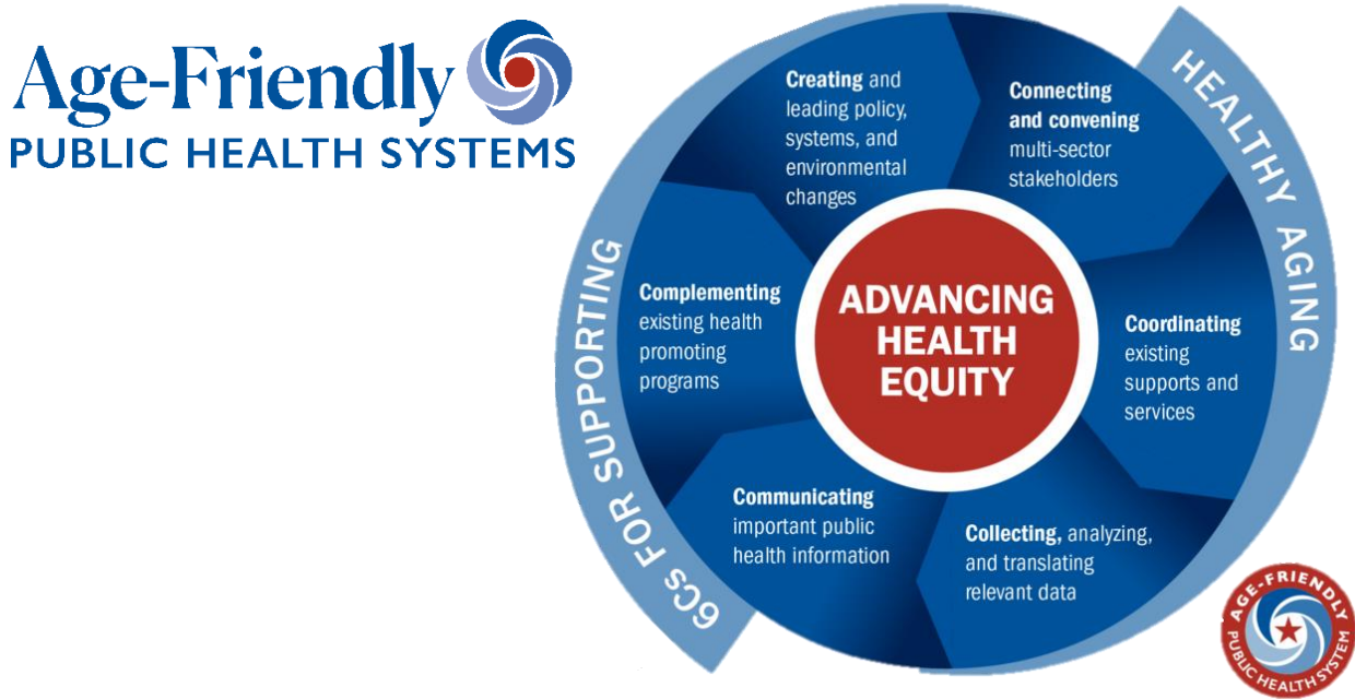
Figure 1 Age-Friendly Public Health Systems 6Cs Framework